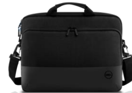
DELL PRO SLIM BRIEFCASE 15 | PO1520CS

With fast, high-power delivery of up to 65W/hr, this power bank can charge the widest range of USB-C® laptops and mobile devices.