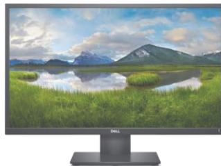
DELL 24 MONITOR | E2420HS

Work at full speed with Dell's powerful USB-C dock. Charge your system faster, support up to three displays and connect to your peripherals via a single cable.