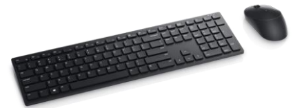
DELL PRO WIRELESS KEYBOARD AND MOUSE | KM5221W

A 23.8" monitor enhances your daily workflow. Featuring a height adjustable stand, Full HD resolution and integrated speakers in a space-saving design.