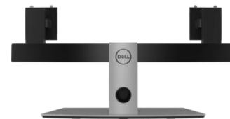
DELL DUAL MONITOR STAND | MDS19

Hear every word clearly on your next call with the Dell Pro Stereo Headset, optimized to provide in-person call quality.