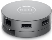
DELL USB-C MOBILE ADAPTER | DA310

Featuring the widest variety of ports available, the compact 7-in-1 Dell USB-C Mobile Adapter offers seamless connectivity to various devices like monitors, projectors, headsets, keyboard, mouse, flash drives and other accessories.