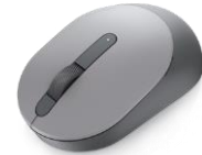
DELL MOBILE WIRELESS MOUSE | MS3320W

A dependable everyday companion providing eco-friendly quality protection and water-resistant protective coating for your device and other essentials.