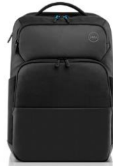
DELL PRO SLIM BACKPACK 15 | PO1520PS

Featuring the widest variety of ports available, the compact 7-in-1 Dell USB-C Mobile Adapter offers seamless connectivity to various devices like monitors, projectors, headsets, keyboard, mouse, flash drives and other accessories.