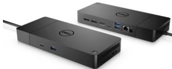
DELL DOCK | WD19S

Work at full speed with Dell's powerful USB-C dock. Charge your system faster, support up to three displays and connect to your peripherals via a single cable.