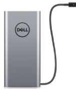
DELL USB-C NOTEBOOK POWER BANK 65W/65WHR | PW7018LC

Work seamlessly with dual-mode connectivity (2.4GHz wireless or Bluetooth) and 36 months of