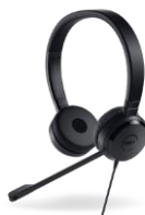
DELL PRO STEREO HEADSET | UC150

Enhance your all-day productivity with this wireless keyboard and mouse combo. Keeps your desk clutter-free and lets you stay productive with up to 36 months battery life and programmable shortcut buttons.